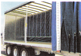
Photo 3 (above): With soft sides, one or both sides pull back to enable forklift loading.