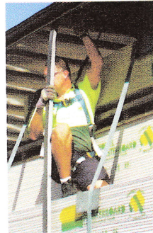
Photo 8: Strap down of tall loads inside a soft side trailer may require fall protection within the shell of the trailer.

b) A fall arrest system provided by the shipper and/or receiver typically consists of T-posts or upside down Ls with cable or rail with sheaves or trolleys and SRLs.