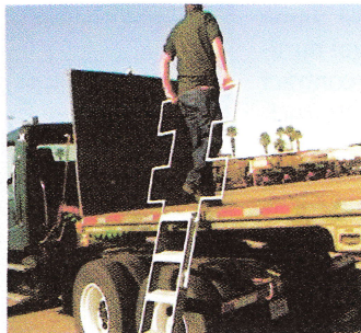
c) A fall arrest net

system erected on a wall structure next to the trailer can be attached to the flatbed frame to form a trough to fall into on either side of the trailer (Photo 10).