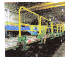
Photo 9: Temporary guardrails are a measure that can reduce falls from the trailer.