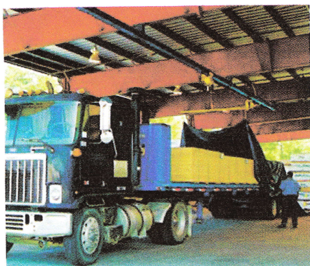
(From top) Photo 5: A tarp is loaded using an overhead hoist.