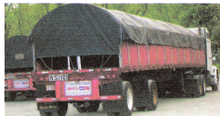
Photo 1 (left): Upside-down Ls reach over tank trucks. The cable and SRL are accessed with a tag line.