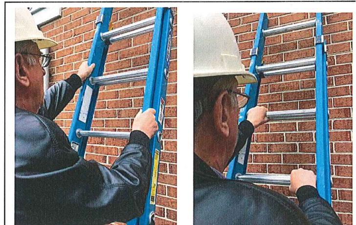
Climbing a ladder using three-point control (left) and three-point contact (right).

Unlike three-point control, three-point contact requires three points of support without specified body parts with an unspecified ladder or structure. No shapes or sizes exist for adequate support using three points of contact. Three-point control requires using the hands to grab and hold a support so that one hand can reasonably support the climber's body weight or more in an emergency.